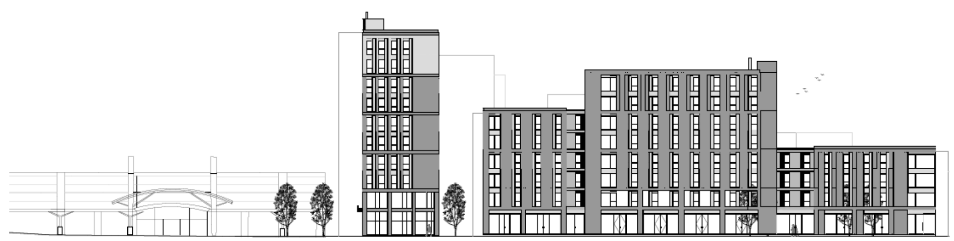
Proposed North East Elevation