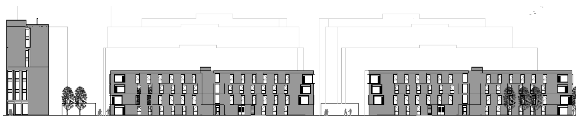
Tritton Road Elevation