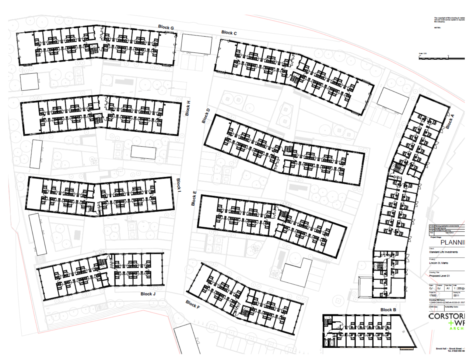
Overall First Floor Plan