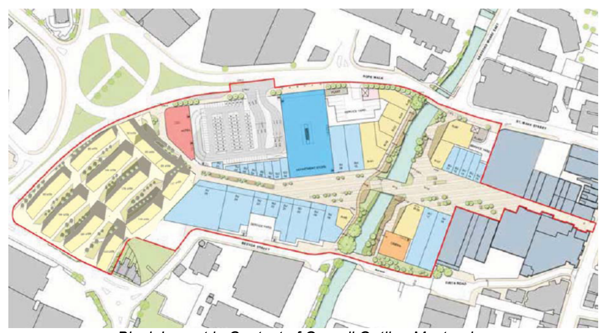
Block Layout in Context of Overall Outline Masterplan