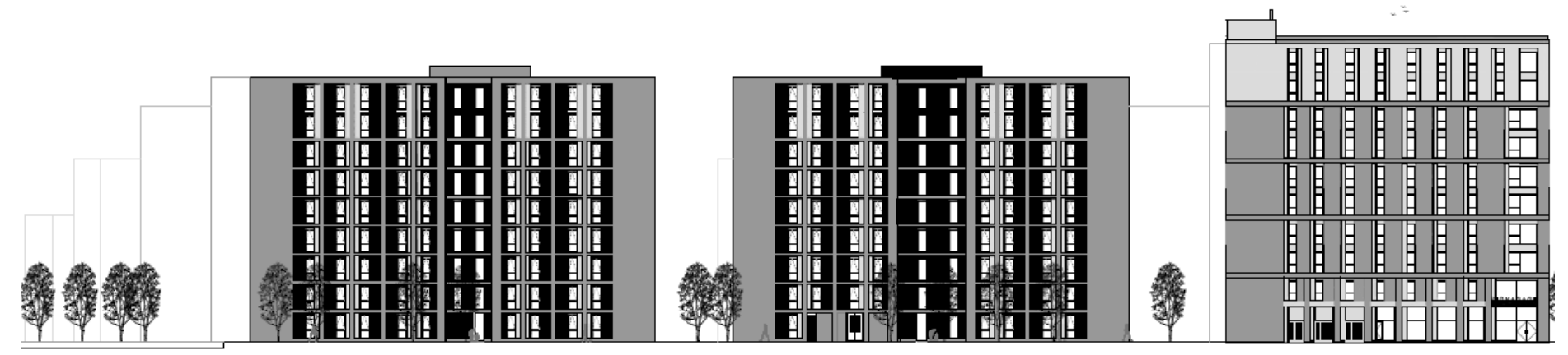
Proposed South East Elevation